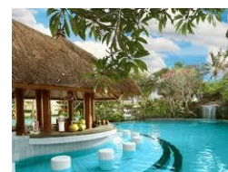
Grand Mirage Hotel, Bali, Indonesia